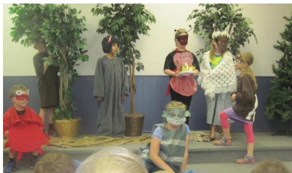
“You are the king!”