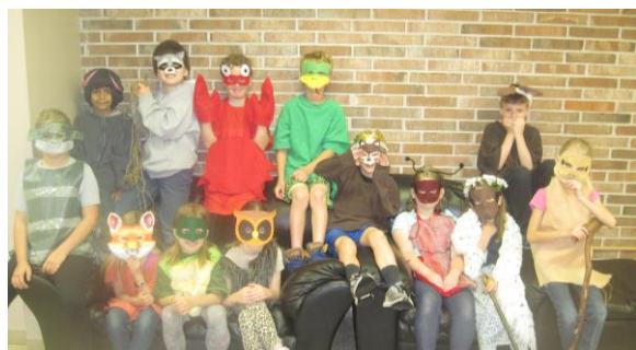
Acacia 2 cast – “A King for Brass Cobweb”