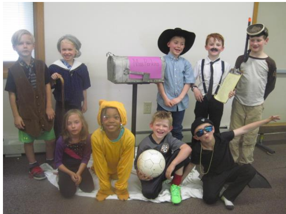
“Where is that Cat?” first grade cast.

For those of you who made it to our class plays, thank you so much for coming and showing the students your support. For beginner thespians, they did a fine job!